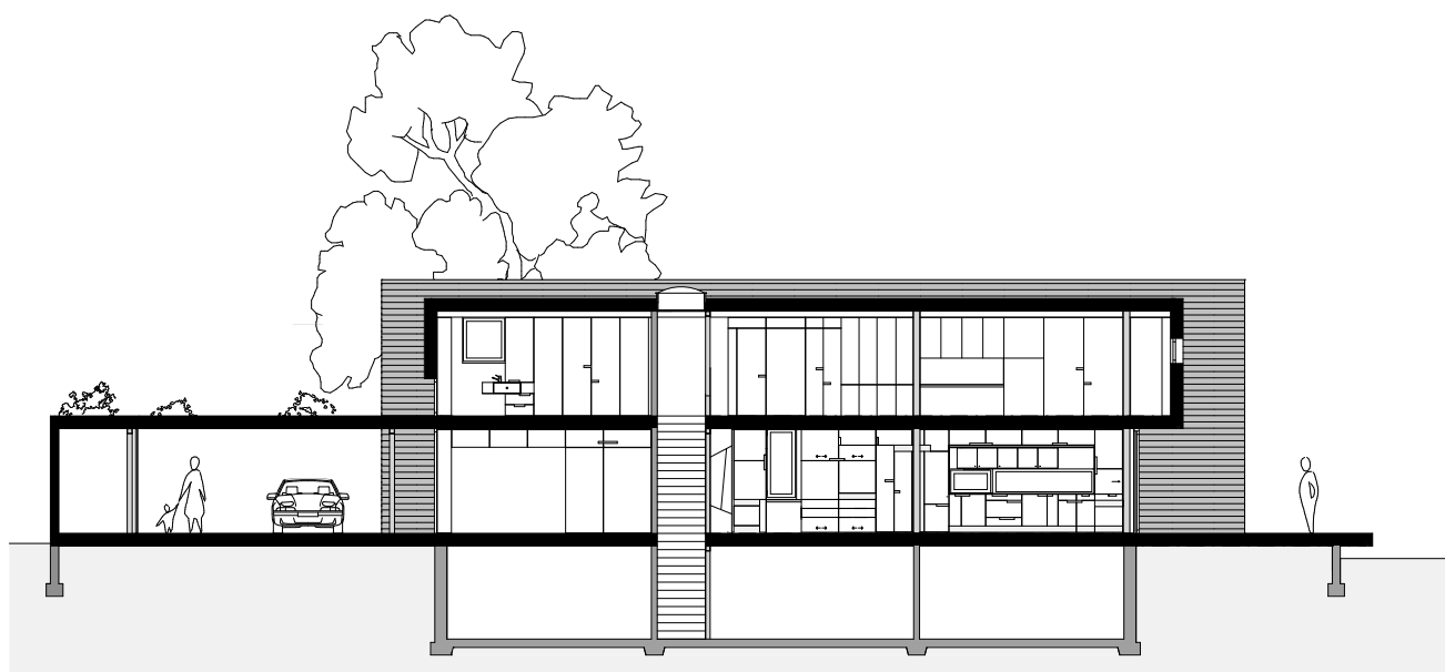
coupe longitudinale 1/200